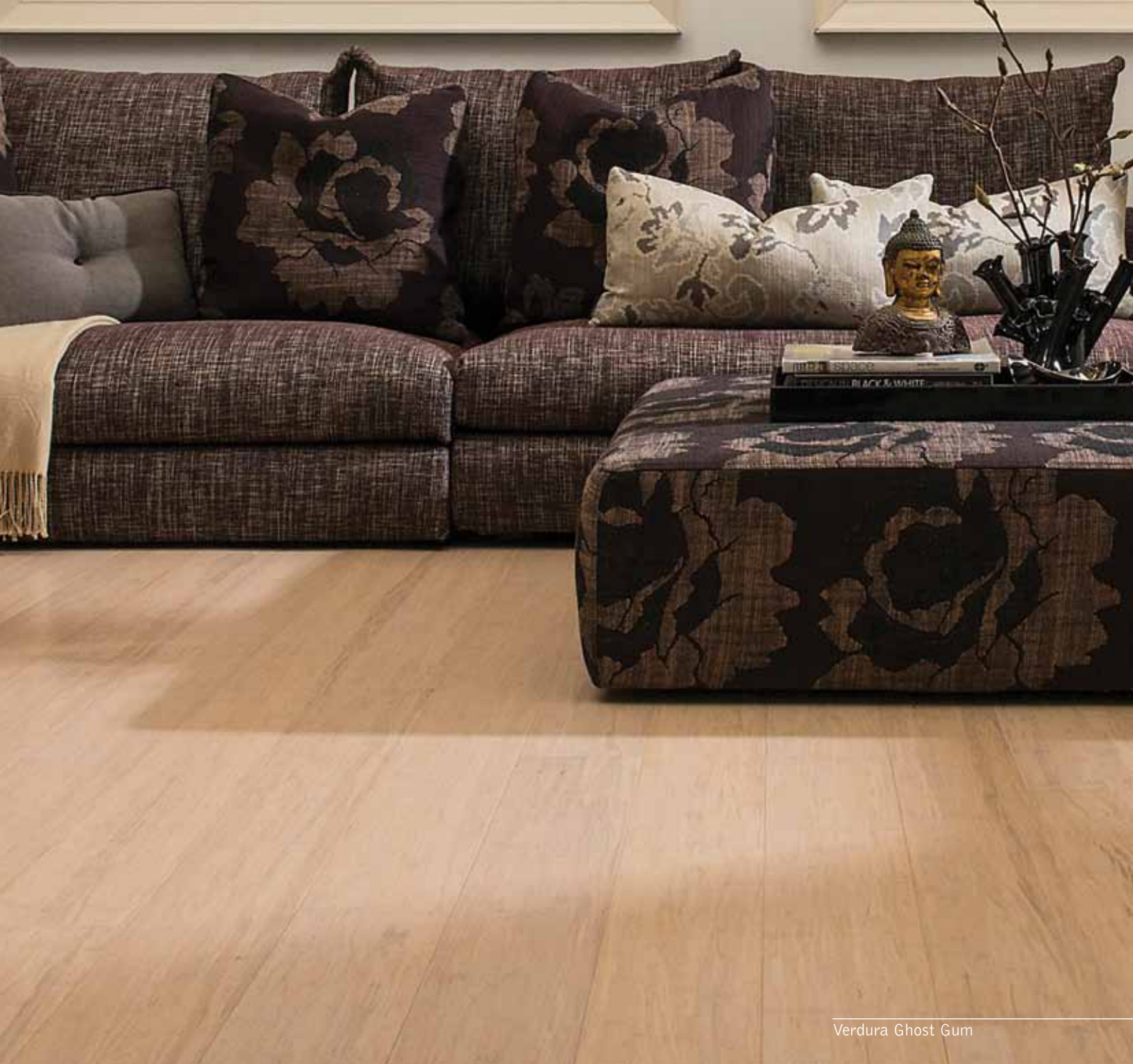
Verdura Ghost Gum