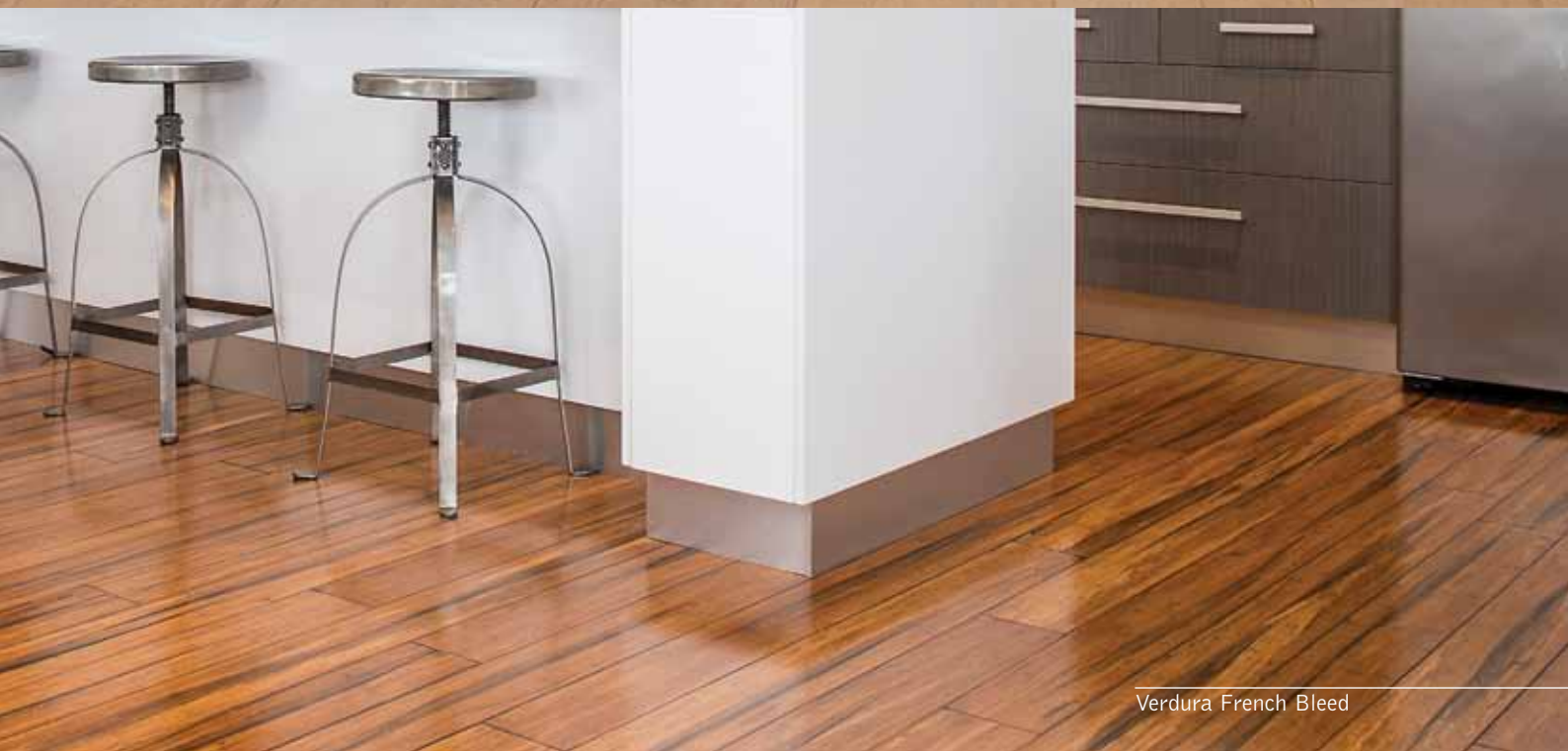
Verdura French Bleed