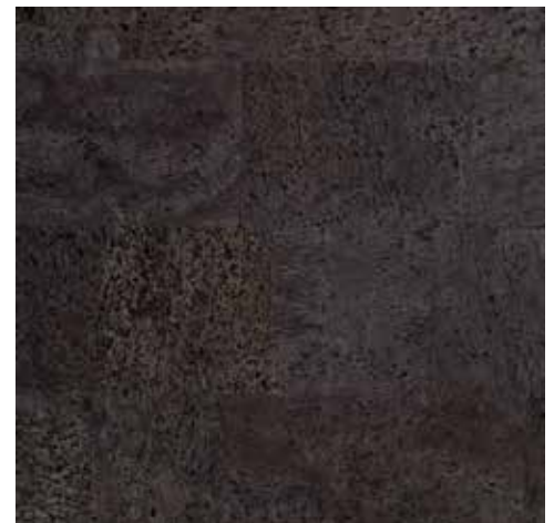
ANTIQU LEATHER AMBIENT RC-ANTLEATH