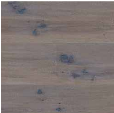
OAK SIENA VITA RCV-OAKSIENA