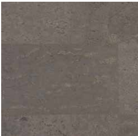
SLATE AMBIENT RC-SLATE