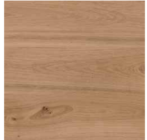
OAK ANTIQUE VITA RCV-OAKANTIQUE