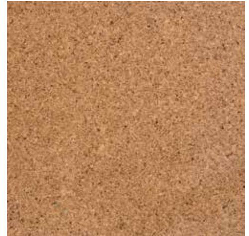
TRADITIONAL AMBIENT RC-TRAD