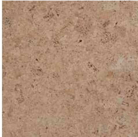
CHAMPAGNE SAND AMBIENT RC-CHAMPSAND