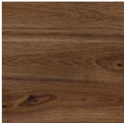
OAK JAVA VITA RCV-OAKJAVA