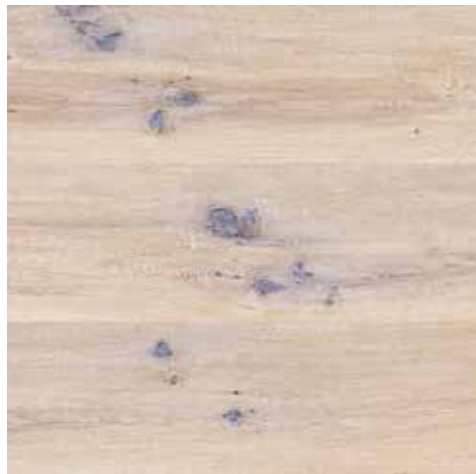
OAK PEARL VITA RCV-OAKPEARL