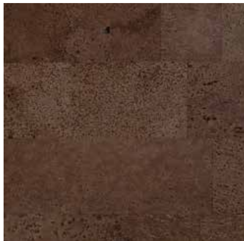
RUSTIC OLIVE AMBIENT RC-RUSTOLIVE