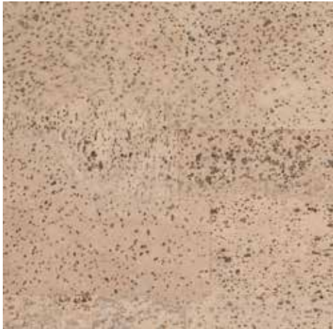
HARMONY IVORY AMBIENT RC-HARMIVORY

TILE SIZE: LENGTH: 910 MM | WIDTH: 300 MM | THICKNESS: 10.5 MM | 1 BOX: ± 1.64 M 2