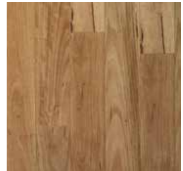
BLACKBUTT | COLONIAL LPE 11000

The printed designs give an idea of the actual colour and nuances of the pattern but are not contractual. The patterns shown are only a sample and not a full overview of all the different nuances within the design.