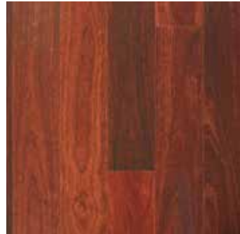
JARRAH | COLONIAL LPE 11003