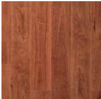
SYDNEY BLUE GUM | COLONIAL LPE 11002