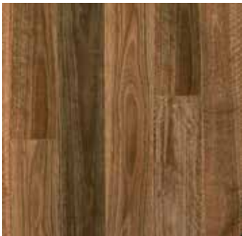
SPOTTED GUM | COLONIAL LPE 11001

Inspired by the great outdoors with a rich blend of brown tones, Spotted Gum is as true to nature as the NSW hardwood that has fast become Australia's most popular wood flooring species. Let the light in, then relax and enjoy.