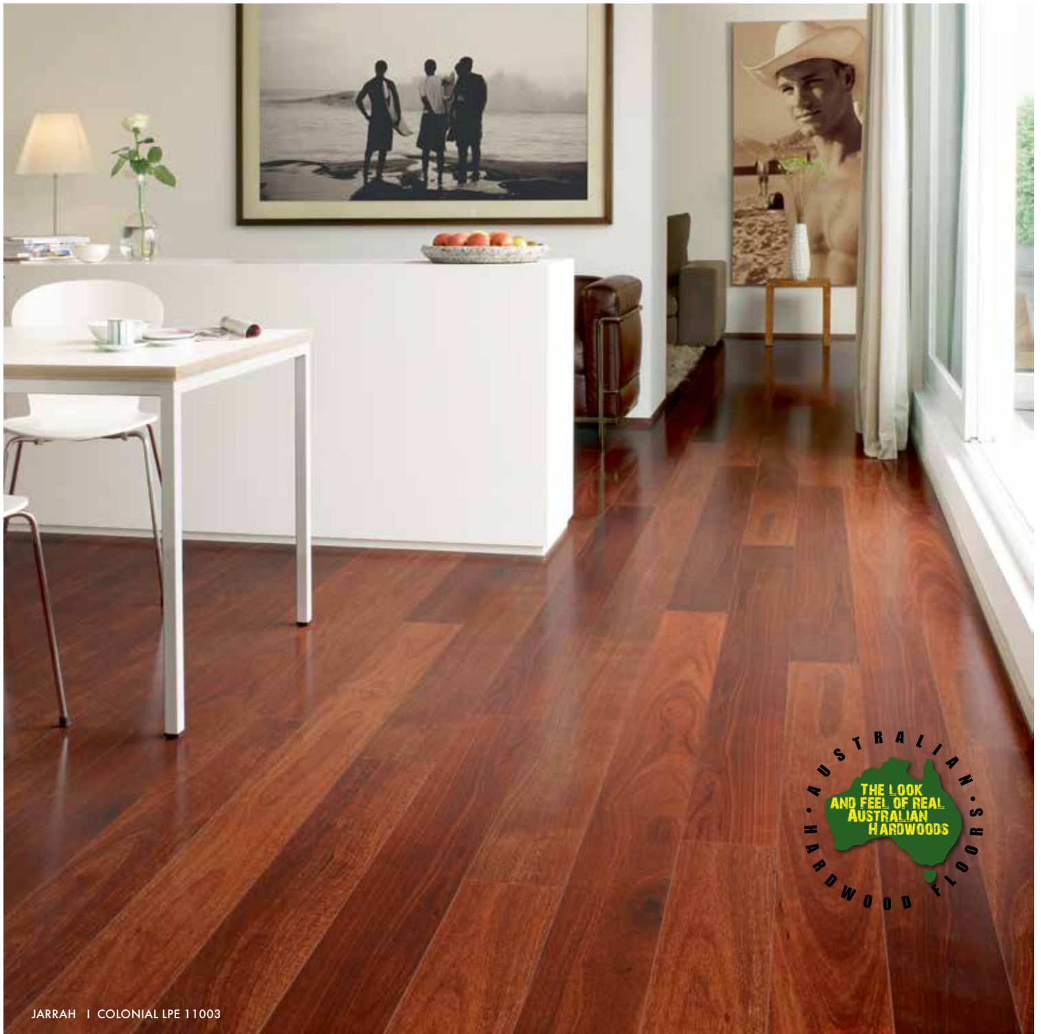
JARRAH | COLONIAL LPE 11003