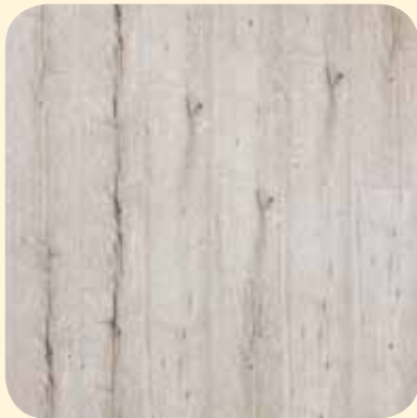
OLD OAK GREY BRUSHED CXF073