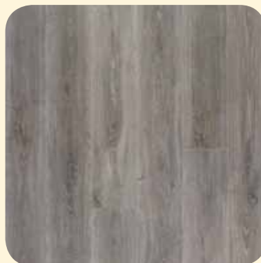
AUTHENTIC OAK LIGHT GREY CXF044