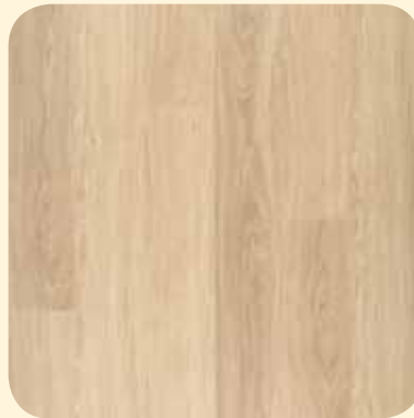
CLASSIC OAK WHITE VARNISHED CXF047