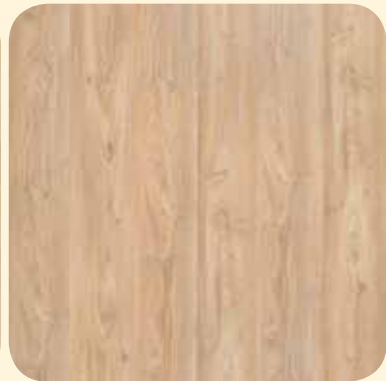
PLANKED NATURAL OAK CXF026