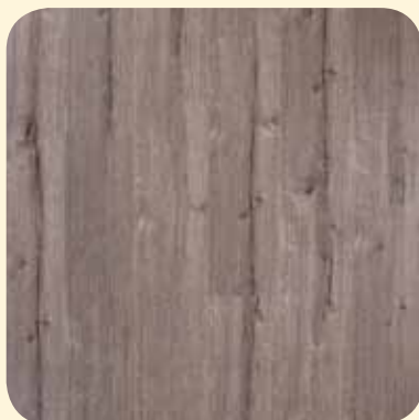
OLD OAK DARK GREY BRUSHED CXF074