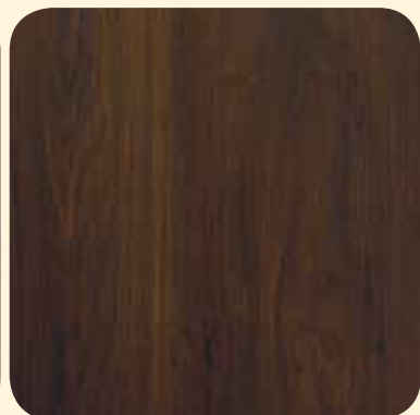
RUSTIC OAK DARK BROWN CXF053