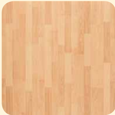
ENHANCED BEECH 3-STRIP CXF001