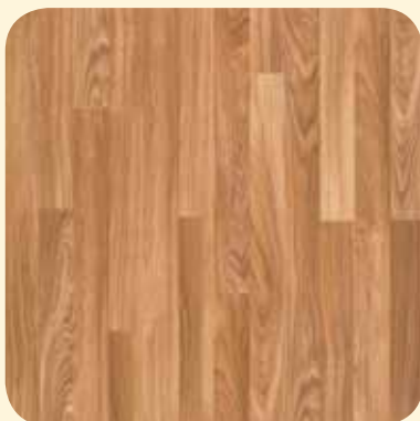
BRUSHBOX 2-STRIP CXF007