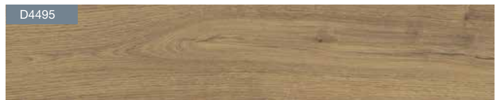
KA14 – Sunshine