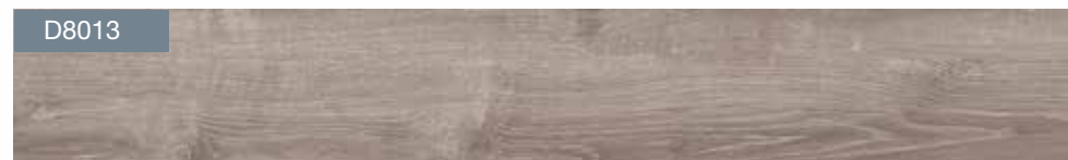
KA8 – Helsinki