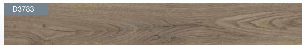
KA8 – Montreux