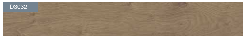
KA12 – Verbier