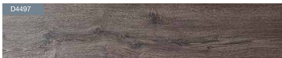
KA14 - Terra