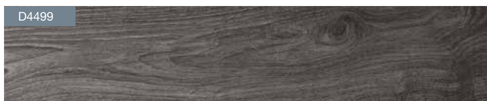
KA14 - Volcano