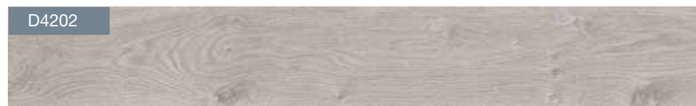
KA12 – Interlaken