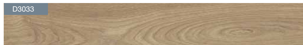
KA8 – Zermatt