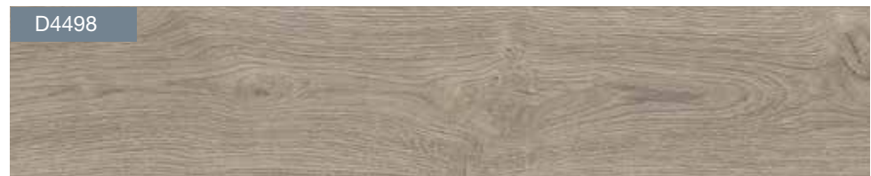
KA14 – Moon