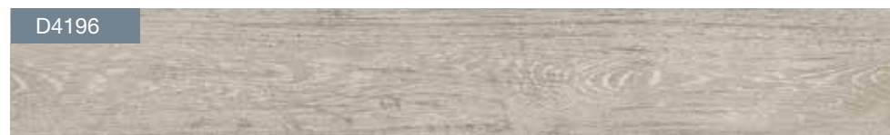
KA12 – Sand