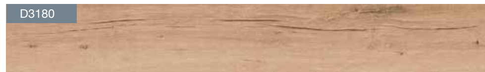
KA8 – Lugano Oak