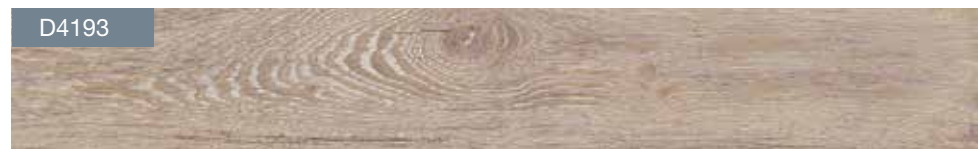
KA12 – Tan