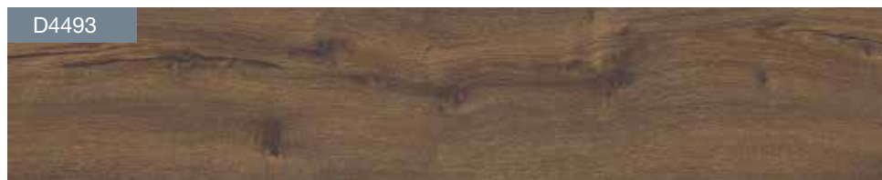
KA14 - Sunset