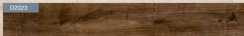
KA8 – Bourbon