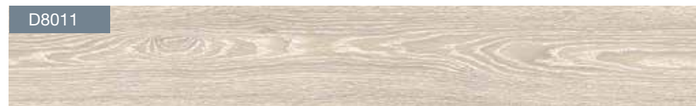
KA8 – Strassbourg