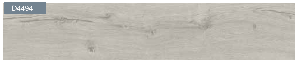
KA14 – Snow