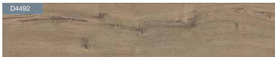
KA14 - Beach