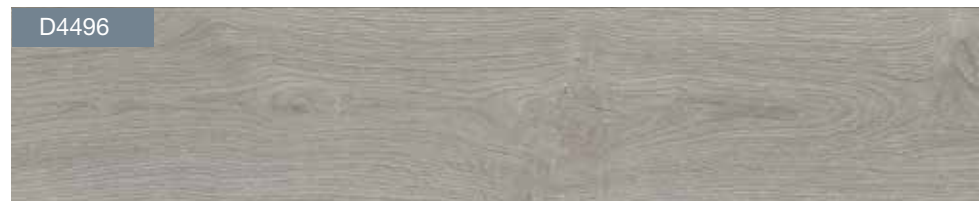
KA14 – Rock